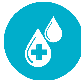
Sanitation and hygiene