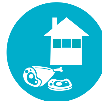
Antibiotics in agriculture and the environment